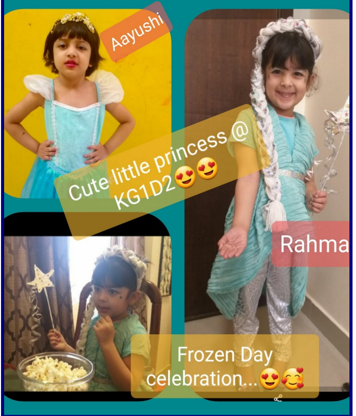
Frozen Day on 12/1/21 with KG1. Students are learning all about Winter in a totally immersive, fun way!